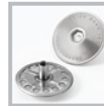
CB9650 & CB9651