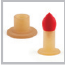
CB9170 & CB9173