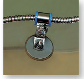
Studs & Standoffs

For more information, please contact sales at +1-775-885-8000, or email: sales@clickbond.com